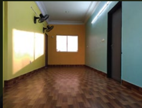
Space for Events